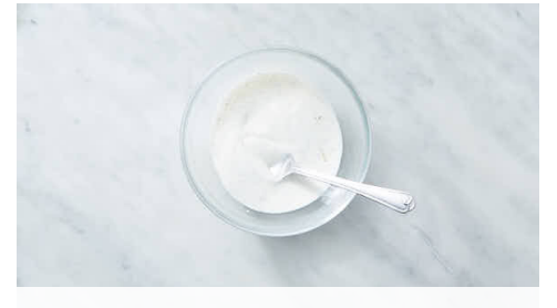
5. Make ranch

Add all but 2 lettuce leaves and toss to coat.