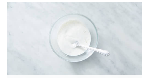
5. Make ranch

Add all but 2 lettuce leaves and toss to coat.