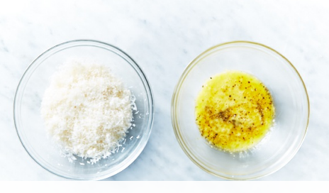
2. Prepare breading

Finely grate Parmesan . Trim and discard ends from Brussels sprouts , then cut in half. Halve and slice all of the onion into ½-inch thick wedges through the core.