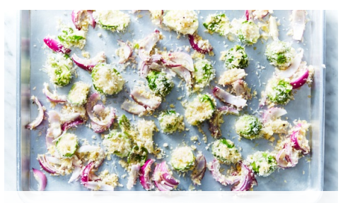
3. Bread vegetables

Place panko in a separate medium bowl and toss with Parmesan , ½ teaspoon salt , and a few grinds of pepper .