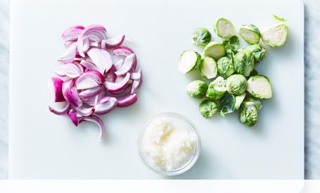
1. Prep ingredients

Calories 730kcal, Fat 52g, Carbs 35g, Protein 36g