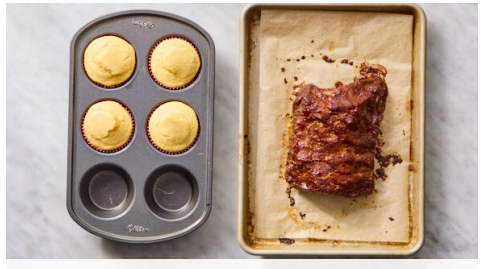
5. Bake cornbread

Transfer ribs to prepared baking sheet, meat side up; brush with a layer of barbecue sauce . Bake on upper rack until sauce is dried and tacky, 12-15 minutes.