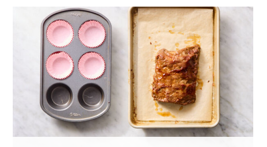
4. Bake ribs

Add half of the greens to pot and stir until beginning to wilt, about 1 minute. Add remaining greens, broth concentrate, and 1 cup water. Bring to a simmer, cover, and reduce heat to medium-low. Cook, stirring occasionally, until greens are tender, 30-35 minutes.