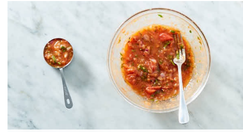
5. Make tomato salsa

Pat steaks dry, then rub with oil and season all over with salt and pepper . Return same skillet to medium-high. Add steaks and cook until well browned and medium-rare, about 3 minutes per side (or longer for desired doneness). Transfer to a cutting board to rest.