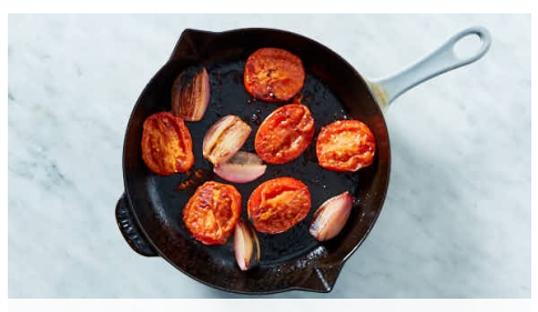
3. Sear tomatoes & shallots

Halve tomatoes and shallot lengthwise. Coarsely chop parsley leaves and stems together.