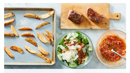
6. Make salad & serve

While steaks rest, finely chop charred shallots. Transfer charred tomatoes to a medium bowl and, using a potato masher or fork, coarsely mash into a chunky salsa. Stir in chopped shallots and parsley, 1/4 cup oil, and 11/2 tablespoons vinegar. Season to taste with salt and pepper.