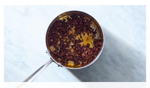
2. Cook aromatics

In a small saucepan, combine rice , 1¼ cups water , and ½ teaspoon salt Bring to a boil. Cover and cook over low heat until rice is tender and liquid is absorbed, about 17 minutes. Keep covered until ready to serve.