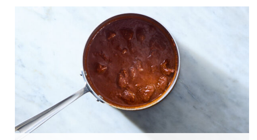
4. Add pork & simmer

To saucepan with onions , add broth concentrate , tamari , 1 tablespoon each of sugar and vinegar , and 1½ cups water . Blend with an immersion blender until smooth (or transfer to a blender and blend until smooth, then return sauce to saucepan). Bring to a boil.