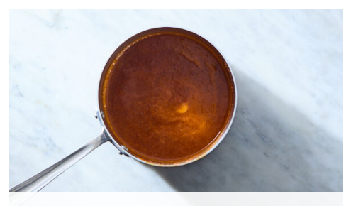
3. Make sauce

In a medium saucepan, heat 2 tablespoons oil over medium. Add all but ¼ cup onions and a pinch of salt . Cook, stirring occasionally, until softened and just starting to brown, about 5 minutes. Lower heat to medium-low. Add dark chili powder and Tex-Mex spice ; cook, stirring frequently, until aromatic, about 1 minute.