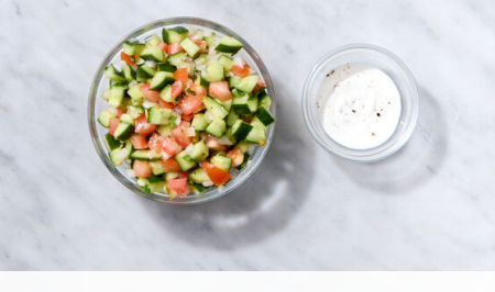
4. Prep sauce & salad

Finely chop parsley leaves and stems . Finely chop half of the onion ; set aside for step 5.