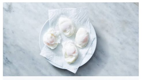
5. Poach eggs

Roast beef and kale on center oven rack until kale is tender and beef is browned in spots, 8-10 minutes. Finely grate 1 teaspoon lemon zest into a small bowl, then cut lemon into wedges. Finely chop 1 teaspoon garlic and dill fronds and stems . To bowl with zest, add garlic and dill . Sprinkle half of the gremolata over ingredients on baking sheet.