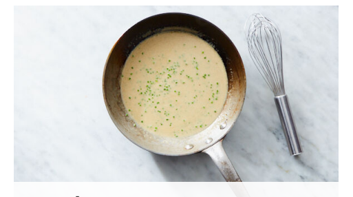
5. Make cream sauce

Add 1 tablespoon oil, 2 thyme sprigs , and shrimp to same skillet. Cook until shrimp are just cooked through, 2-3 minutes. Transfer to plate with steak.