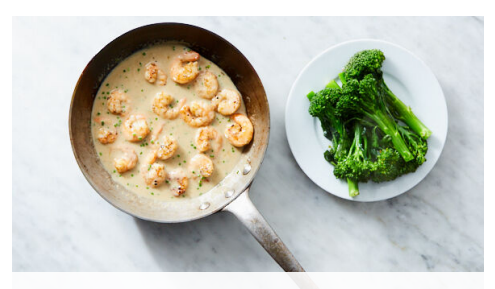
6. Heat broccolini & serve

To same skillet, add mirin, remaining broth concentrate, 1 tablespoon vinegar, and ¼ cup water. Cook, scraping up any browned bits from bottom of skillet, until reduced by half, 1-2 minutes. Add mascarpone, chives, and chopped butter. Remove from heat. Whisk constantly until smooth and creamy, about 1 minute. Stir in shrimp and steak resting juices; discard thyme.