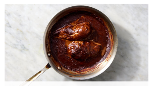
5. Bake chicken

Add raisins, peanut butter, remaining tomatillos, ¼ teaspoon chipotle chili powder, and 1¼ cups water. Bring to a simmer and cook over medium heat until lightly thickened, about 5 minutes. Transfer to a blender and process until smooth. Season to taste with salt and pepper.