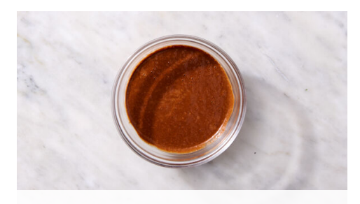
4. Blend mole

In same skillet, heat 3 tablespoons oil over medium-high. Add half of the onions ; cook, stirring frequently, until lightly browned, 4-6 minutes. Add chopped garlic ; cook until just starting to brown, 1-2 minutes. Add 3 tablespoons cocoa powder . Cook, stirring constantly, until fragrant, 15-30 seconds.