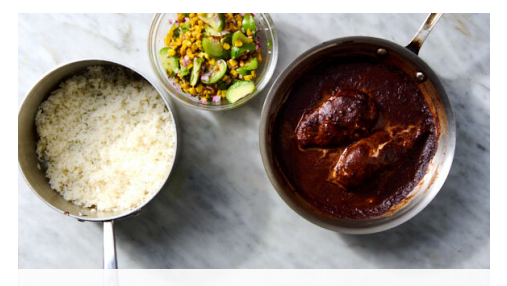
6. Finish salad & serve

Bake on center oven rack until just cooked through (internal temperature should register 160°F), 10-15 minutes. Let rest for 5 minutes.