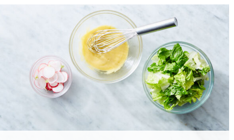
3. Prep salad

Heat 1 tablespoon oil in a medium skillet over medium-high. Add beef and season with a pinch each of salt and pepper . Cook until well browned, 5-7 minutes.