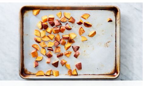
2. Cook potatoes

Peel and finely grate 1 teaspoon ginger . Finely grate 1 teaspoon garlic .