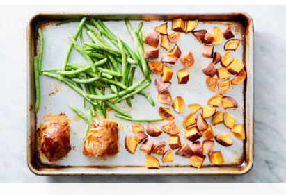
3. Roast pork & green beans

Broil potatoes on upper oven rack until just charred and sticky, 3-5 minutes.