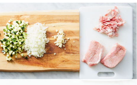
1. Prep ingredients

Calories 1010kcal, Fat 69g, Carbs 25g, Protein 66g