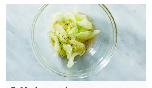
5. Marinate celery

Bring to a boil over high heat and stir to combine. Reduce heat to medium-high and let simmer vigorously, stirring frequently to prevent sticking and for even cooking, until pasta is all dente and liquid is reduced to a sauce that coats the pasta, 12-15 minutes. Sauce should be thick and glossy.