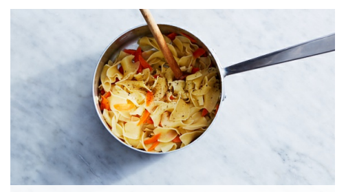
5. Boil noodles & carrots

Add beef broth concentrate and 1 cup water . Cook, stirring occasionally, until liquid is reduced by about half, 3-5 minutes.