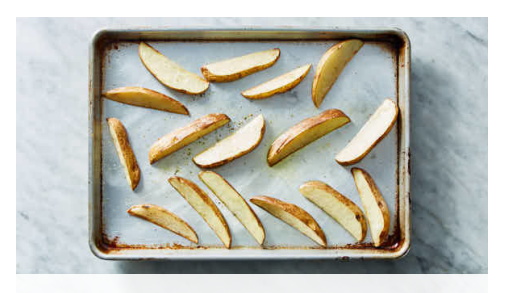
1. Roast potato wedges

Calories 1080kcal, Fat 59g, Carbs 103g, Protein 45g