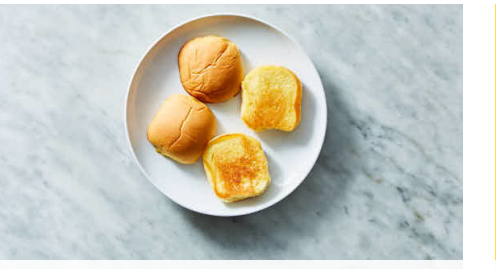
4. Toast buns

In a medium bowl, stir to combine sliced shallots , cucumbers , 1 tablespoon vinegar , and ¼ teaspoon sugar . Season to taste with salt and pepper . Set aside, stirring occasionally, until ready to serve.