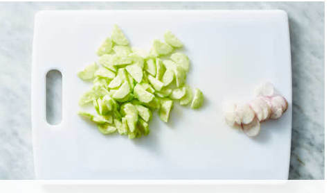
2. Prep pickle ingredients

Preheat oven to 450°F with a rack in the lower third. Scrub potatoes , then cut lengthwise into ½-inch thick wedges. On a rimmed baking sheet, toss potatoes with 1 tablespoon oil , then season with salt and pepper . Roast on lower oven rack until potatoes are golden and crisp, 23-25 minutes, flipping potatoes halfway through.