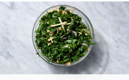
2. Mix slaw

In a medium skillet, cook walnuts over high heat, stirring frequently, until lightly toasted, 2-3 minutes.