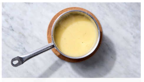
3. Cook polenta

In a large bowl, massage kale with 2 tablespoons oil until dark green and wilted. Mix in apples, walnuts, sliced shallots, half of the Parmesan , and 1 tablespoon apple cider vinegar (or more to taste). Season to taste with salt and pepper . Set aside until ready to serve.