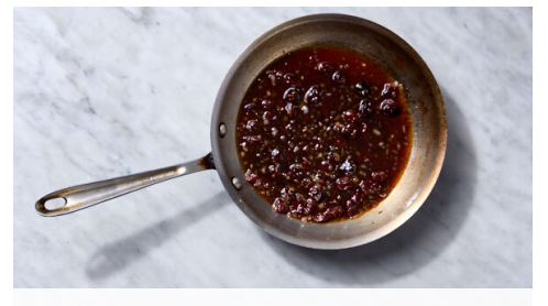
5. Cook cherry gastrique

In reserved skillet, heat 2 tablespoons oil over medium-high until shimmering. Add pork (it should sizzle vigorously) and cook until golden-brown and medium (145°F internally), 2-3 minutes per side (or longer for desired doneness). Transfer to a plate.