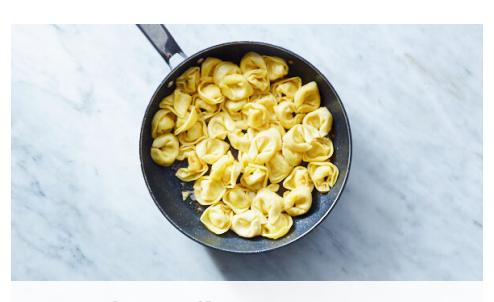
2. Cook tortelloni

Meanwhile, finely grate Parmesan, if necessary.