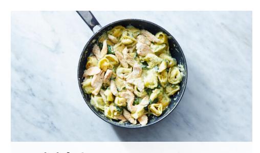
4. Finish & serve

tortelloni. Add half of the Parmesan. stirring to incorporate. Bring to a simmer and cook, stirring occasionally, until sauce is slightly thickened, 1-2 minutes. Reduce heat to medium-low and stir in spinach, pesto, and 2 tablespoons water until spinach is wilted. Remove skillet from heat and season to taste with salt and pepper .