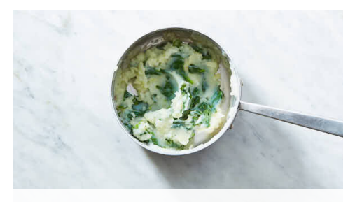
6. Mash cauliflower & serve

Add broth mixture to skillet with mushrooms . Bring to a boil, scraping up browned bits from the bottom; cook until reduced by half, 2-3 minutes. Reduce heat to medium. Whisk in cream cheese and lemon juice until sauce is smooth. Season to taste with salt and pepper . Return chicken and any juices to skillet and turn to coat in sauce. Cover to keep warm.