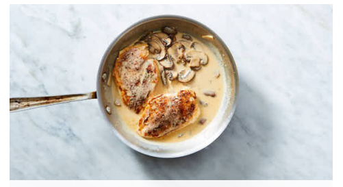
5. Finish sauce

Heat 2 teaspoons oil in a medium skillet over medium-high. Add chicken and cook until browned and cooked through, about 4 minutes per side. Transfer to a plate. Add mushrooms and 1 tablespoon oil to same skillet. Season with salt and pepper . Cook, stirring occasionally, until tender, 2–3 minutes. Stir in remaining sliced garlic .