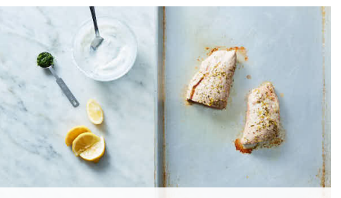
3. Cook chicken; make sauce

In a medium bowl, combine zucchini, 1 tablespoon oil , and ¼ teaspoon of the grated garlic. Season with salt and pepper , and toss to combine.