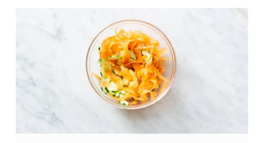
4. Marinate cucumbers

Transfer to a medium bowl and toss with half of the hoisin sauce and 1 tablespoon water. Season to taste with salt and pepper.