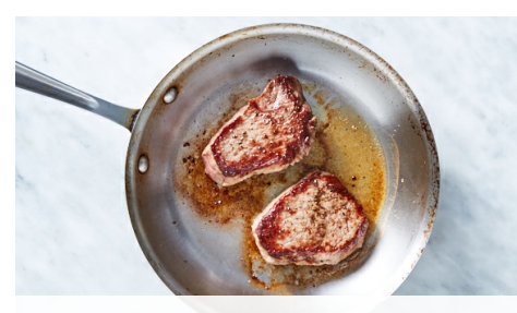
5. Cook beef tenderloin

Drizzle Brussels sprouts and onions with 1 tablespoon oil . Roast on center oven rack until tender and golden brown, stirring halfway through, 20-25 minutes total.