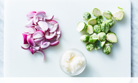
1. Prep ingredients

Calories 780kcal, Fat 52g, Carbs 34g, Protein 48g