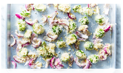
3. Bread vegetables

Place panko in a separate medium bowl and toss with Parmesan , ½ teaspoon salt , and a few grinds of pepper .