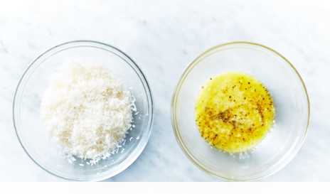
2. Prepare breading

Finely grate Parmesan . Trim and discard ends from Brussels sprouts , then cut in half. Halve and slice all of the onion into ½-inch thick wedges through the core.