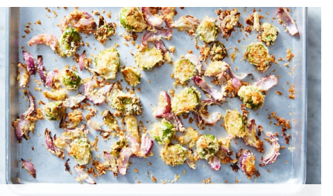
4. Roast vegetables

Sprinkle any remaining panko breading over the veggies.