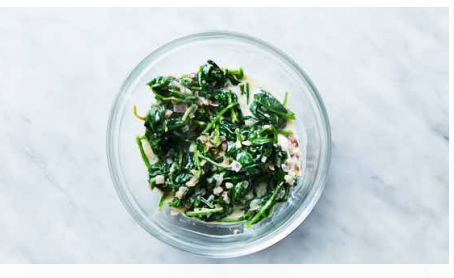
3. Cook spinach

Meanwhile, finely chop shallot . Finely chop 1 large garlic clove . Pick and finely chop ½ teaspoon thyme leaves from remaining sprigs. In a liquid measuring cup or small bowl, whisk to combine cream cheese and ¼ cup water (it's ok if it's lumpy).