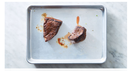
5. Cook steaks

Stir in remaining sour cream and 1 teaspoon water . Season to taste with salt and pepper .