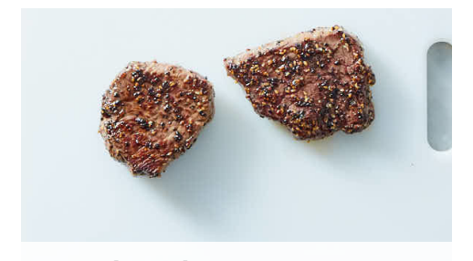
5. Cook steaks

Pat steaks dry and season all over with salt and pepper . Season one side of each steak only with 1 tablespoon everything bagel seasoning , pressing to help seasoning adhere.