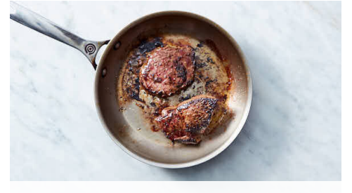
5. Cook steaks

Meanwhile, bring a medium saucepan of salted water to a boil. Trim green beans. Pick 1 teaspoon thyme leaves from stems, then finely chop; discard stems. Add green beans to boiling water; cook until crisp-tender, 3-4 minutes. Drain well, then return to saucepan and drizzle with oil. Cover to keep warm until ready to serve.