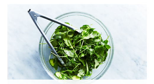
6. Finish salad & serve

In a small bowl, whisk to combine all of the mayonnaise and Dijon mustard and 2 teaspoons water. Season creamy Dijon to taste with salt and pepper.