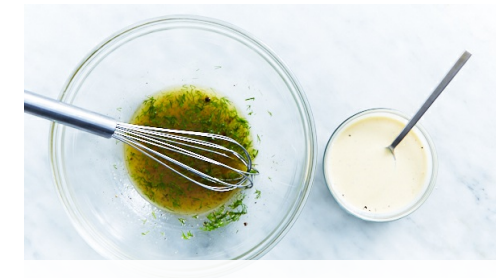
5. Make dressing & dip

Transfer chicken to a paper towel-lined plate. Season with salt and pepper .