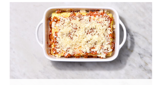
5. Bake lasagna

In a separate bowl, whisk 1 large egg. Stir in ricotta, remaining chopped parsley, and remaining mozzarella and Parmesan; season to taste with salt and pepper.