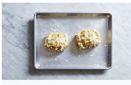
2. Make pull-apart bread

Preheat oven to 425°F. Finely chop half of the onion . Reserving liquid , drain chickpeas . Pick and chop 1 tablespoon thyme leaves (save rest for own use). Finely grate 1 teaspoon lemon zest into a small bowl, then squeeze in 1 tablespoon juice . Pat chicken dry; season all over with salt and pepper .