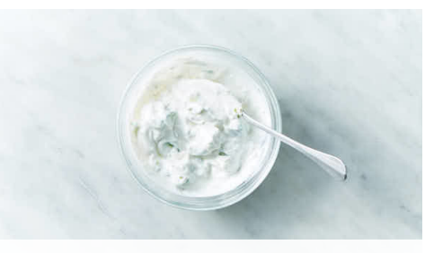
3. Make tzatziki

In a medium bowl, whisk to combine 3 tablespoons oil and 1½ tablespoons vinegar; season to taste with salt and pepper. Add tomatoes and all but ¼ cup of the cucumbers to dressing and toss to coat. Set aside until ready to serve.