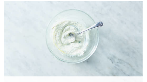
5. Season sauce

Meanwhile, heat 1 tablespoon oil in a medium skillet over medium-high. Add pork ; sear until browned on one side, 2-3 minutes. Flip pork, then transfer skillet to the top oven rack and roast until firm to the touch, slightly pink, and 145°F internally, about 8 minutes. Transfer to a cutting board and let rest for 5 minutes.