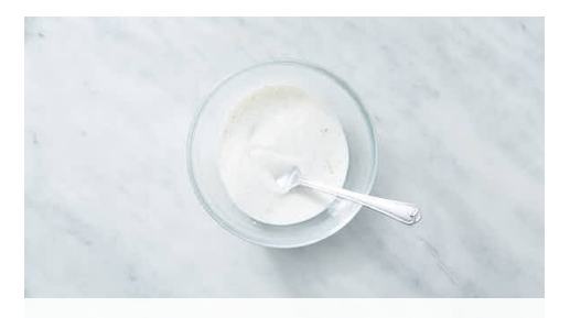
5. Make ranch

Add all but 2 lettuce leaves and toss to coat.