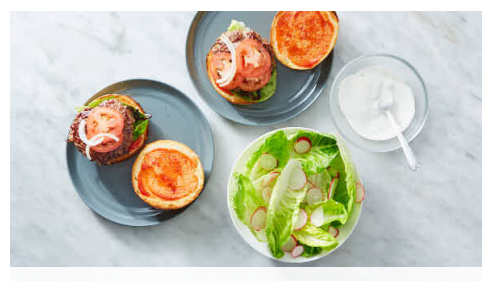
6. Finish & serve

In a small bowl, combine all of the sour cream and half of the ranch seasoning (save rest for own use). Thin with water , 1 teaspoon at a time, to reach desired consistency. Season to taste with salt and pepper .