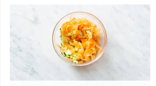
4. Marinate cucumbers

Transfer to a medium bowl and toss with half of the hoisin sauce and 1 tablespoon water. Season to taste with salt and pepper.