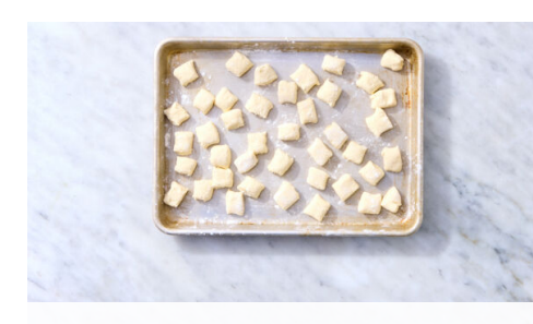
3. Roll gnocchi

Dough should be slightly sticky but not loose; add 1 tablespoon flour at a time if still very moist after kneading with the spatula for 1 minute.