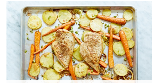
4. Roast chicken & olives

Meanwhile, coarsely chop olives , removing pits, if necessary. Pat chicken dry; pound to an even ½-inch thickness, if necessary. Season all over with 1 teaspoon of the ras el hanout spice blend (save rest for own use) and ½ teaspoon salt . Heat 1 tablespoon oil in a medium skillet over medium-high. Add chicken and cook until golden but not cooked through, 2-3 minutes per side.