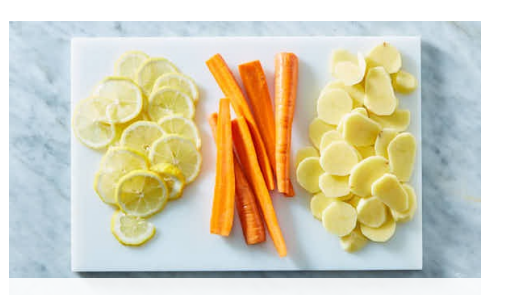
1. Prep ingredients

Calories 590kcal, Fat 35g, Carbs 26g, Protein 41g