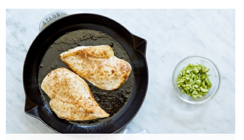
3. Pan-sear chicken

Toss carrots, potatoes, and lemon slices with 3 tablespoons oil on a rimmed baking sheet. Season with ¾ teaspoon salt and a few grinds pepper . Roast until carrots and potatoes are softened and golden, and lemon is starting to brown, about 20 minutes. Discard any blackened lemon slices.