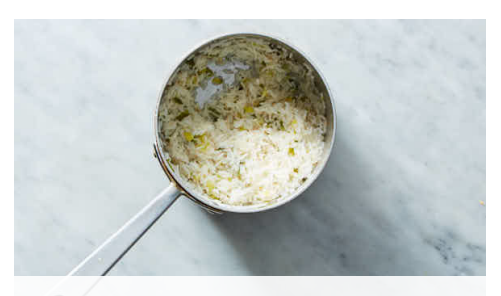
2. Cook rice

Trim stem ends from broccoli , then cut crowns into 1-inch florets. Toss on a rimmed baking sheet with 1 tablespoon oil , and season with salt and pepper . Roast on upper oven rack until tender and well browned in spots, 12–15 minutes. Heat 1/4 inch oil in a medium skillet over medium-high until shimmering. Place 1/4 cup flour in a shallow bowl.