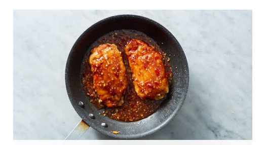
6. Sauce chicken & serve

Lift chicken from marinade , then evenly dredge in flour ; discard marinade. One at a time, dip chicken in batter , turning to coat. Add to skillet (see front of recipe for tip) and fry until golden-brown and cooked through, about 5 minutes per side (if chicken sticks to pan, it means it's not ready to be flipped). Transfer to a paper towel-lined plate. Season with salt .