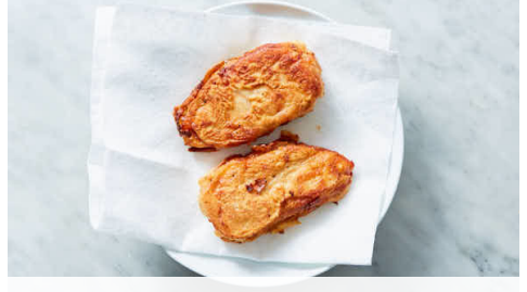
5. Batter & pan-fry chicken

Finely chop 1 teaspoon ginger. Squeeze 1 tablespoon lemon juice into a medium bowl; whisk in Thai chili sauce, ginger, remaining tamari and garlic, and ¼ cup water; set aside until step 6. Cut any remaining lemon into wedges. In a 2nd medium bowl, whisk ⅓ cup each of flour and water. Season batter with salt and pepper (should be thick like pancake batter); set aside.