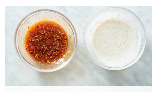
3. Make sauce & batter

Trim scallions, then thinly slice. Heat 2 teaspoons oil in a small saucepan over medium-high. Add rice, 1 teaspoon garlic, and ½ of the scallions. Cook until rice is lightly toasted, 1 minute. Add 1¼ cups water and ½ teaspoon salt, bring to a boil. Cover, reduce heat to low, and cook until water is absorbed, about 17 minutes. Remove from heat and keep covered until step 6.