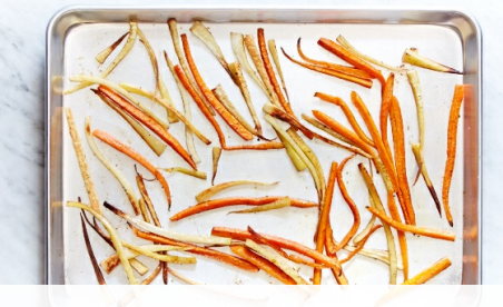
2. Roast vegetables

Season chicken with pepper and ½ teaspoon salt. Beat 1 large egg and 1 tablespoon water in a bowl; season with salt and pepper. In a second bowl, combine 1½ teaspoons of the paprika, ¾ cup flour, and ½ teaspoon salt Coat chicken breasts in flour, then egg. Let excess egg drip off, then repeat in flour then egg; finish in flour. Transfer to a plate.