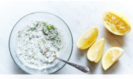
3. Make sauce

Heat ¾ cup oil in a medium skillet over medium-high. When oil is hot (it should sizzle vigorously when a pinch of flour touches it), cook chicken , turning occasionally, until golden and crisp, about 4 minutes (reduce heat if browning too quickly). Transfer to a wire rack to drain.