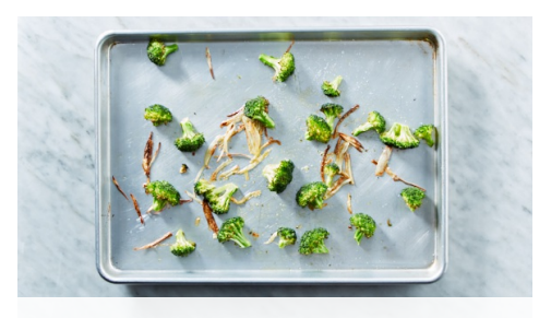
2. Roast broccoli & shallots

Preheat oven to 425°F with a rack in the center. Trim stem ends from broccoli , then cut crowns into 1-inch florets. Halve and thinly slice shallot lengthwise, then finely chop 2 tablespoons of the sliced shallots . Finely chop parsley leaves and stems , keeping them separate. Finely chop 1 large garlic clove . Cut half of the lemon into wedges (save rest for own use).