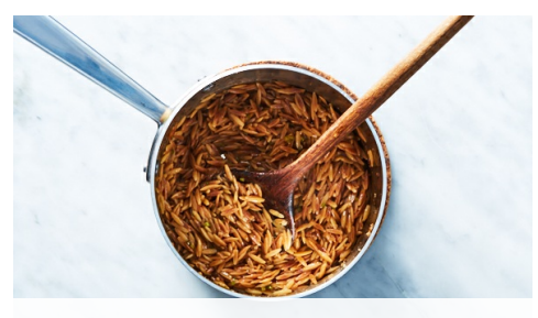
4. Cook pilaf

Meanwhile, heat ½ tablespoon oil in a small saucepan over medium-high. Add chopped shallots and cook, stirring, until golden, 1-2 minutes. Add orzo and cook, stirring, until deep golden brown, 2-3 minutes.