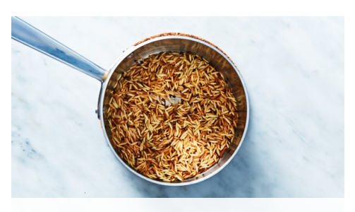
3. Toast orzo

On a rimmed baking sheet, toss broccoli and sliced shallots with 1½ tablespoons oil and a pinch each of salt and pepper . Roast on center oven rack until tender and charred in spots, stirring once, 15-20 minutes (watch closely as ovens vary).