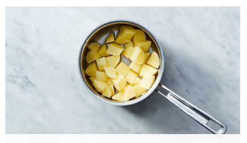
1. Cook potatoes

Calories 960kcal, Fat 63g, Carbs 57g, Protein 49g