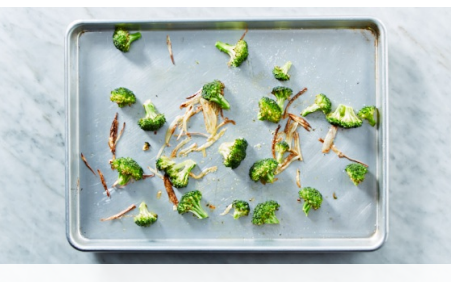
2. Roast broccoli & shallots

To saucepan with orzo , add parsley stems , 1 <sup>1</sup>/<sub>4</sub> cups water , and 1 /<sub>4</sub> teaspoon salt ; bring to a boil. Reduce heat to low; simmer, covered, stirring occasionally, until orzo is tender and liquid is evaporated, 12-15 minutes. (Add additional water, a few tablespoons at a time, and cook for another few minutes, if necessary.) Season to taste with salt and pepper .