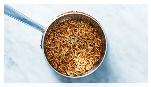
3. Toast orzo

On a rimmed baking sheet, toss broccoli and sliced shallots with 1½ tablespoons oil and a pinch each of salt and pepper . Roast on center oven rack until tender and charred in spots, stirring once, 15-20 minutes (watch closely as ovens vary).