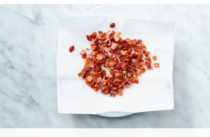
2. Cook bacon

Coarsely chop bacon . Scrub potatoes , then cut into ½-inch cubes. Finely chop 1 teaspoon garlic . Trim scallions , then thinly slice.