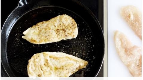
4. Cook the chicken

Heat 1 tablespoon oil in a large skillet over medium-high. Working in batches, cook chicken breast halves until browned and cooked through, about 2 minutes per side.