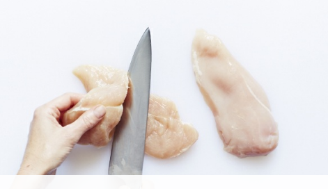
3. Prep the chicken

Combine peaches, shallot, jalapeño, lime zest, lime juice, vinegar, and ¼ cup water in a medium bowl; season with salt and pepper. Set aside until shallot is soft and bright pink, tossing occasionally, about 15 minutes.