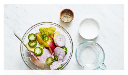
2. Pickle the peaches

Heat 1 tablespoon oil in a large skillet over medium-high. Working in batches, cook chicken breast halves until browned and cooked through, about 2 minutes per side.