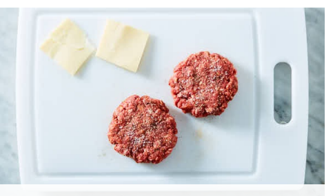
3. Season & shape burgers

Meanwhile, thinly slice <sup>1</sup>/<sub>3</sub> of the onion into rings (save rest for own use), then finely chop half of the onion rings. Finely grate <sup>1</sup>/<sub>2</sub> teaspoon garlic into a medium bowl. Whisk in mayonnaise, 1 tablespoon each of oil and vinegar, <sup>1</sup>/<sub>2</sub> teaspoon salt, <sup>1</sup>/<sub>4</sub> teaspoon sugar, and a few grinds of pepper. Add chopped onions and 4 cups cabbage; toss to combine. Set aside until step 6.