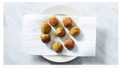
5. Cook falafel

Squeeze 1 tablespoon lemon juice into a small bowl. Add all of the tahini and remaining garlic. Whisk in 1 tablespoon water at a time until sauce is smooth and is the thickness of honey. Season to taste with salt and pepper. Cut any remaining lemon into wedges.