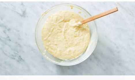
2. Make batter

Finely grate all of the lemon and orange zest into a small bowl. Squeeze all of the lemon and orange juice into a liquid measuring cup (about ¾ cup total).