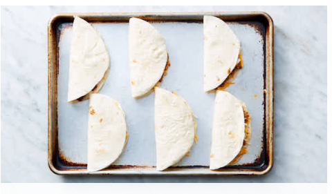
4. Assemble quesadillas

Preheat broiler with a rack in the top position. Halve tomato lengthwise. Squeeze all of the lime juice into a small bowl. Transfer jalapeño, tomatoes , cut side up, and 1 large unpeeled garlic clove to a rimmed baking sheet. Drizzle tomatoes with oil . Broil on top oven rack until vegetables are charred in spots, 5-10 minutes (watch closely). Remove from oven; cool until step 4.