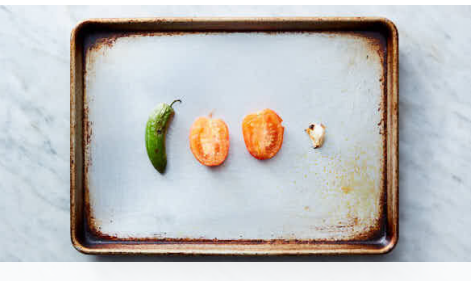
1. Prep ingredients & broil

Calories 1020kcal, Fat 65g, Carbs 66g, Protein 46g