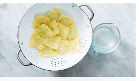
3. Cook ravioli

Melt 2 tablespoons butter in a medium skillet over medium-high heat. Add mushrooms and season with salt and pepper ; cook, stirring occasionally, until browned and dry (water will release from mushrooms then evaporate while cooking), 4-5 minutes.