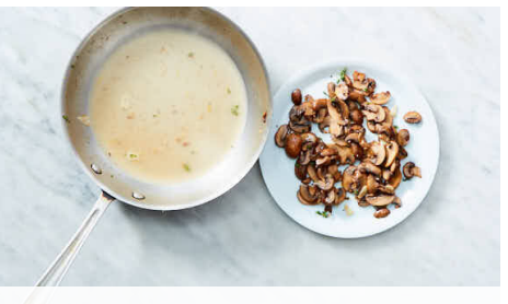
4. Start sauce

Reserve 1 cup cooking water . Drain ravioli; set aside in colander until step 5.