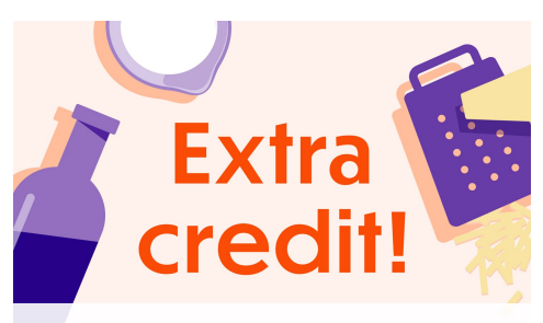
6. Make it ahead!

Serve broccoli cheddar soup ladled into bowls. Enjoy!