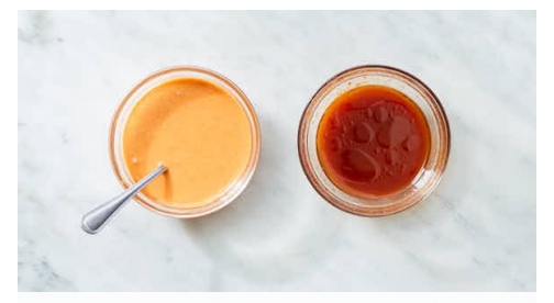
2. Make sauce & glaze

Brush one side of each tortilla generously with neutral oil . Arrange tortillas on a rimmed baking sheet, oiled side down. Divide ground mixture among tortillas, spooning filling onto 1 half of each tortilla, then top with shredded cheddar-jack cheese . Fold in half to close.