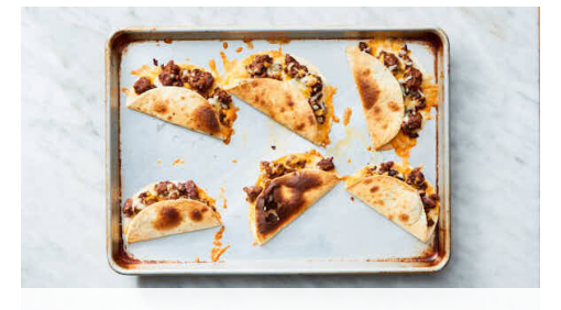
5. Broil quesadillas

Heat 1 tablespoon neutral oil in a medium skillet over high. Add plant-based ground ; cook, breaking up into smaller pieces, until browned in spots, 4-5 minutes. Stir in remaining chopped garlic ; cook until fragrant, about 1 minute. Add glaze ; cook, scraping up browned bits from bottom of skillet, until ground is coated and skillet is mostly dry, 1-2 minutes. Season to taste.