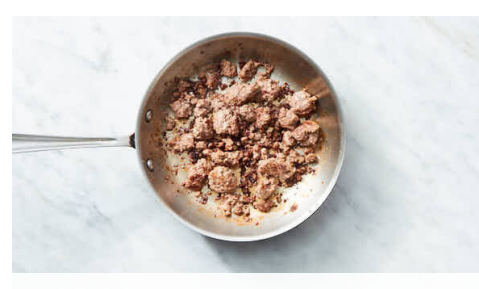
3. Brown plant-based ground

In a 2nd small bowl, stir to combine remaining gochujang and tamari, 3 tablespoons water, 1 tablespoon sugar, and 1 teaspoon sesame oil. Set glaze aside until step 3.