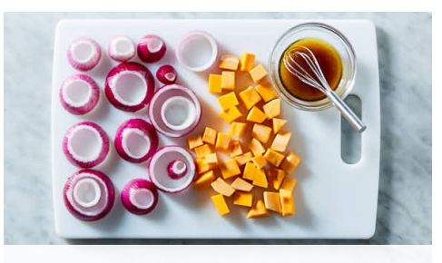
1. Prep veggies & dressing

Calories 910kcal, Fat 51g, Carbs 97g, Protein 21g