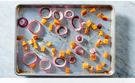
2. Roast vegetables

Preheat oven to 425°F with a rack in the upper third. Peel red onion , then cut into 1-inch slices, and separate into rings. Cut butternut squash into ½-inch pieces, if necessary. In a medium bowl, whisk honey , sherry vinegar , and 3 tablespoons oil until combined. Season to taste with salt and pepper , then reserve for step 3.